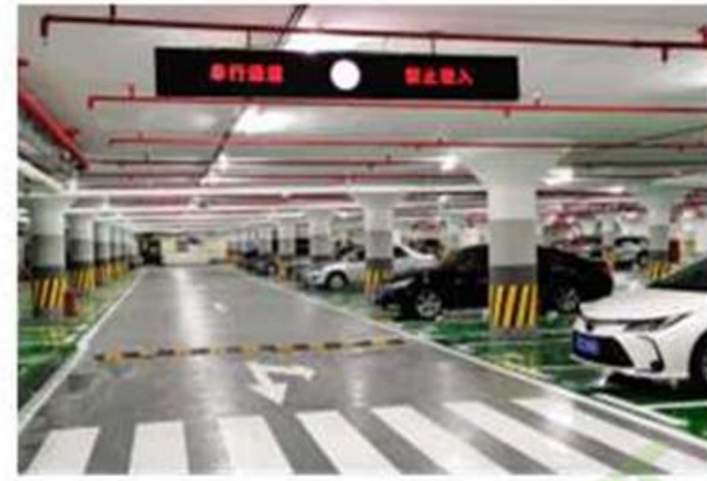
Car Parking Lot