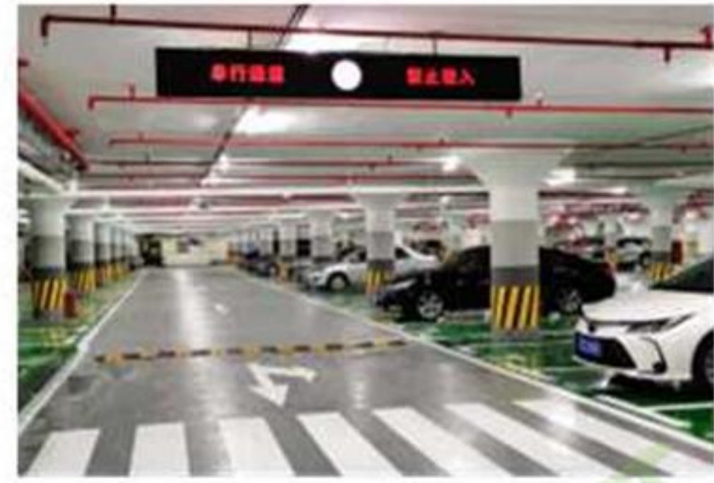
Car Parking Lot