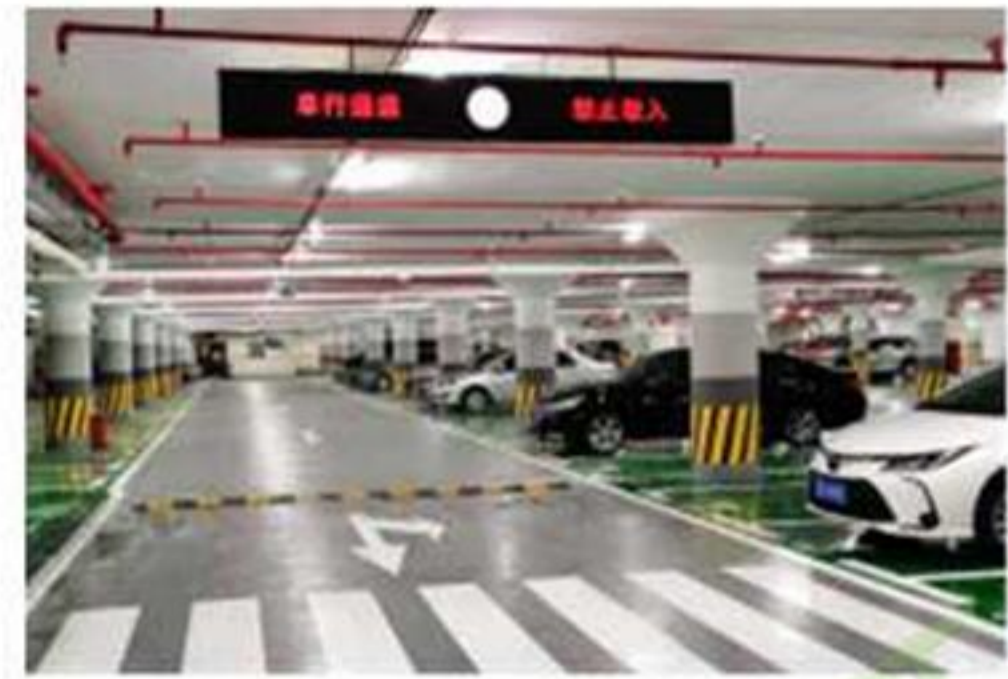
Car Parking Lot