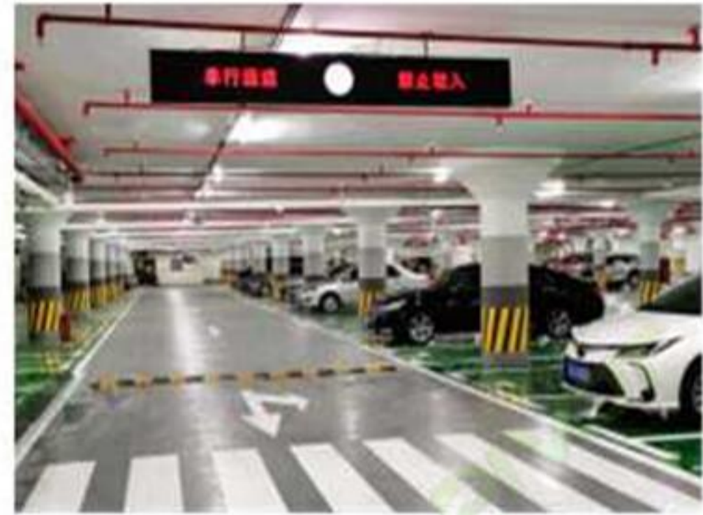
Car Parking Lot