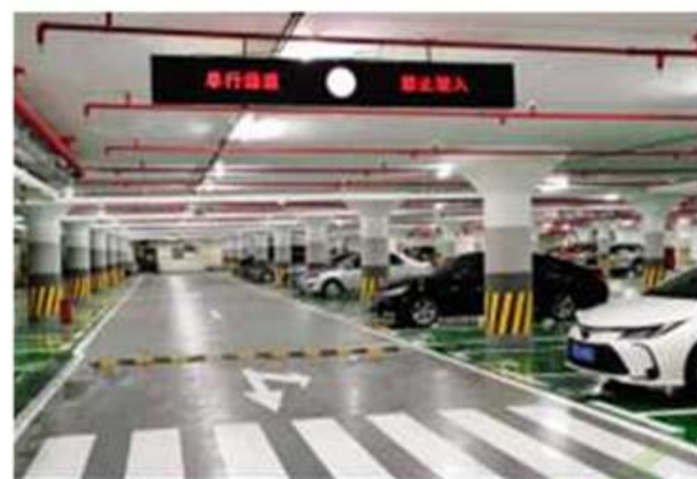
Car Parking Lot