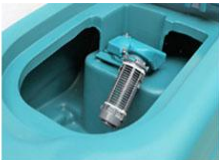
Perfect protection for motors