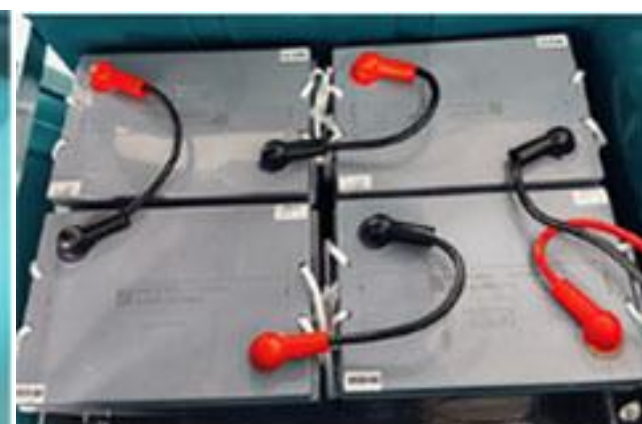
4 maintenance-free batteries are durable and require no manual maintenance