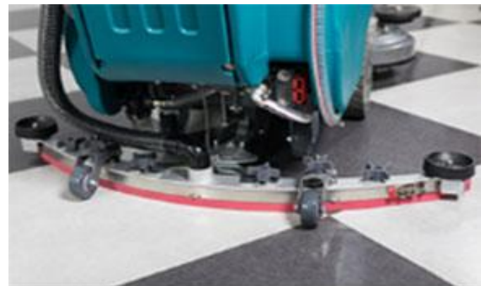
External clear water tank water level display tube for better control of cleaning