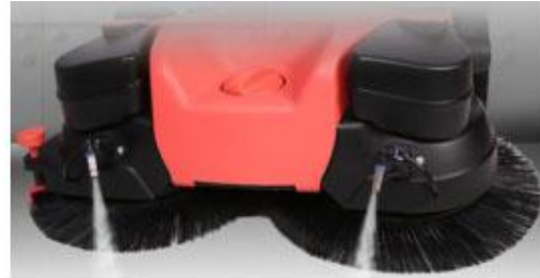
Automatic spray dust suppression Eliminate dust, meet higher cleaning need.