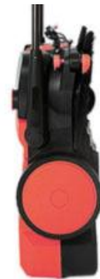
Fold storage to save space