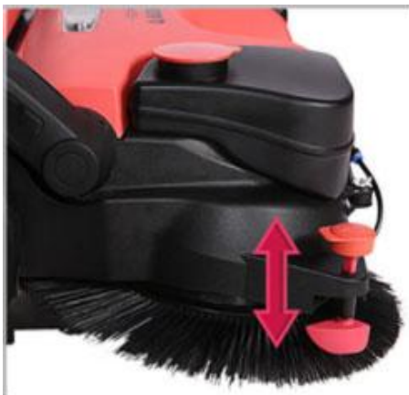
Side brush down pressure device Effectively clean dead angle.