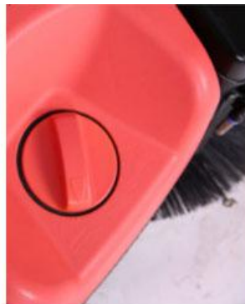
Adjustable front brush height Meet different need of ground and garbage.