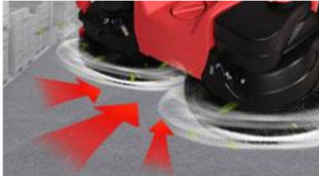
Electric drive for front and back brush Improve cleaning efficiency and save time.