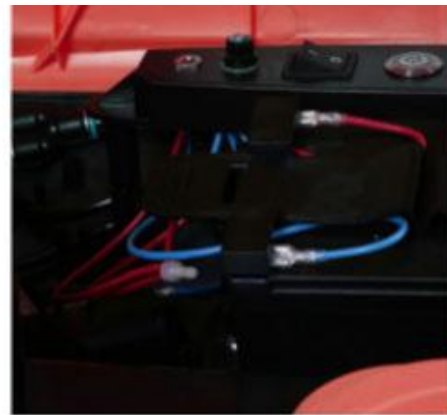
Multiple line protection Ensure safe operation in different environments.