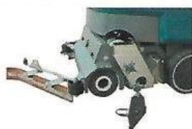
Roller brush can be replaced quickly without tool