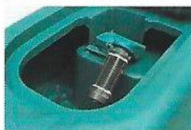
With large opening, the sewage water tank is easy to clean. The polyester material makes the tank very strong, shock-proof and anti-corrosive.