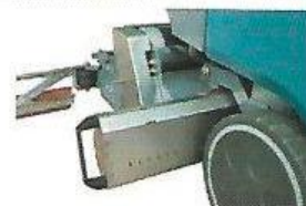
Drawer-type stainless steel garbage box, easy to load/unload and wash