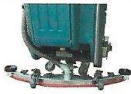
With aluminum casting squeegee, the corrosion-resistance improves greatly. The Linatex squeegee blade has excellent abrasion performance.