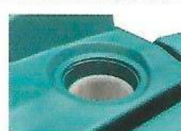
Special designed filling hole ensure easy filling of fresh water. Filter screen is available.