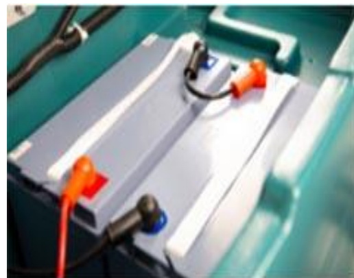
Large-capacity battery meets cleaning needs