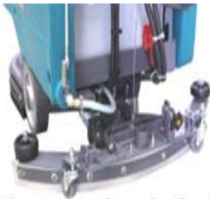
The squeegee is made of cast iron durable and easy to maintain