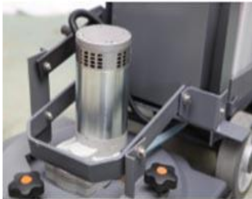
High-power motor with good performance and long life

Equipped with CHILEE battery kit that can provide strong power