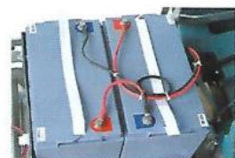
Equipped with 12V CHILEE maintenance-free battery kit