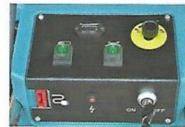
Simple and beautiful operation panel with battery meter, operator can check battery power visually