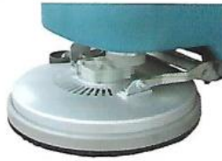
The aluminum casting brush head has better anti-corrosion performance. Brush replacement is easy and quick.