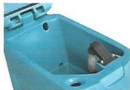
Large water tank can meet cleaning requirement for large area