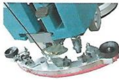
The aluminum casting squeegee has excellent anti-corrosion performance. Equipped with bracket wheel, the squeegee has better stability in work.

Walk behind scrubber PA730 can scrub and dry the cleaning surface at one time. Cleaning with this machine, all sewage, dirt and sand can be sucked into the sewage tank and the surface is as bright as new. This easy-operating machine is flexible and offers excellent maneuverability. It can reduce workload and time, improve cleaning quality, and is an ideal choice for 5000-10000 square meter area.