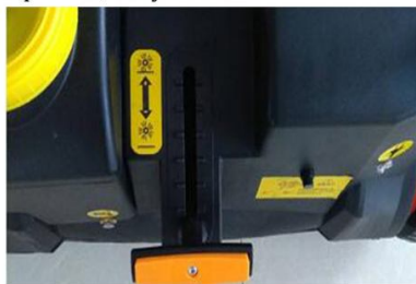
6 grade rolling bruch