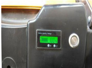
Power display pump power display,any time can monitoring battery power