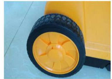
Rubber wheel Beautiful, strong and durable