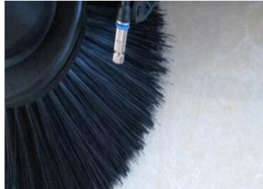
Spray nozzle Adjustable stainless steel spray nozzles ,Iffectively inhibit dusty