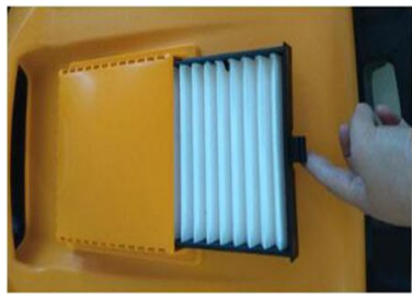
Dust filter Reduce the circulation air pressure of front container replaced, easy to clean.