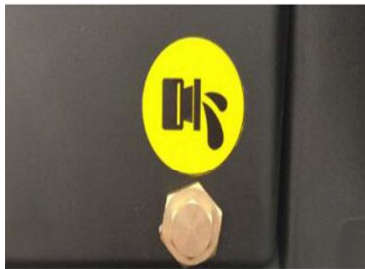
out fall not in use, the water can choose discharg