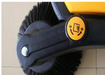
adjustable side bruch