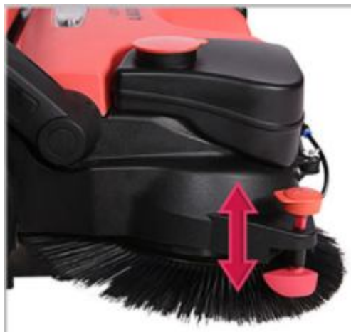
Side brush down pressure device Effectively clean dead angle.