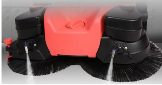
Automatic spray dust suppression Eliminate dust, meet higher cleaning need.