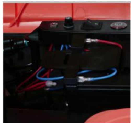
Multiple line protection Ensure safe operation in different environments.