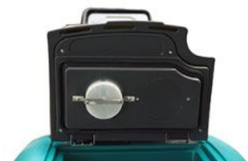
Excellent imported water absorption system, more powerful