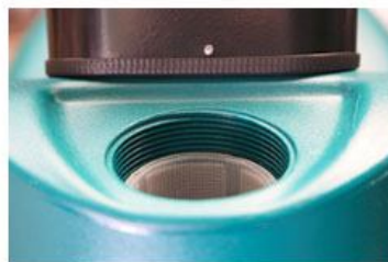
The water inlet is in front, it's convenient for water injection