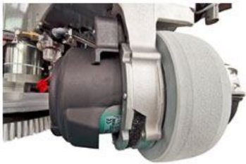
Front drive system with electronic brake, safe and reliable