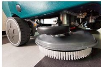
The chassis of the whole vehicle is strong, heavy, solid and durable