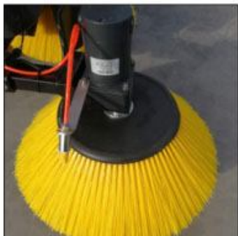
Wear-resistant brush + dual nozzle International advanced motor Automatic lifting