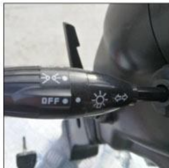
wiper Easy operation and easy adjustment