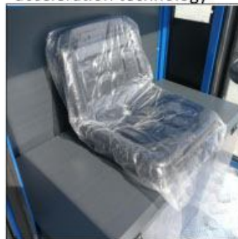
Plush leather comfortable seats The kit comes with the car