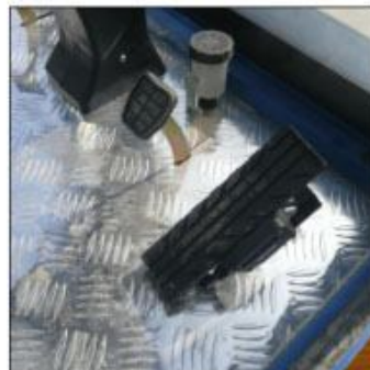
Double disc brake Cars are equipped with standard deceleration and acceleration technology