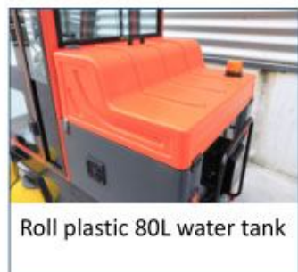
Roll plastic 80L water tank