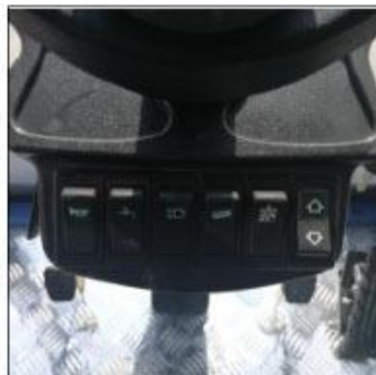
Simple operation key