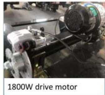
1800W drive motor