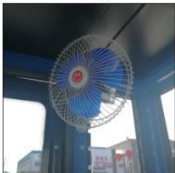
Equipped with small electric fan