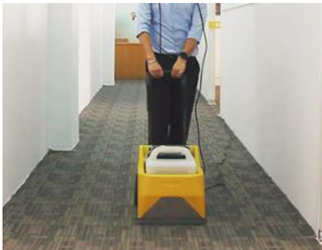
For passageway carpet

Suitable for office, restaurant, corridor, etc..