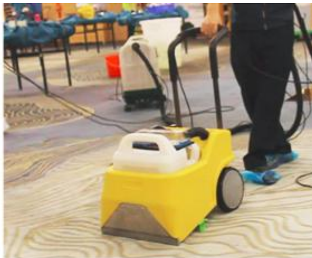
For dining room carpet