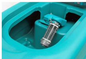
Perfect protection motor