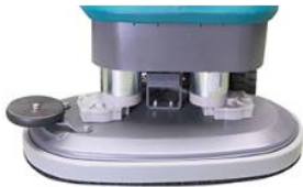
Double brush, more efficient cleaning