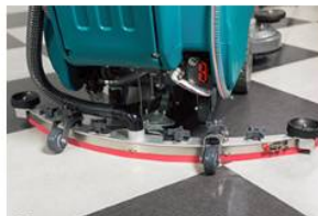
External water level display tube Better grasp of clear water