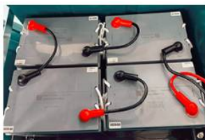
4 maintenance free durable batteries and don't need manual maintenance

With dual brushes PA860 is an easy-handling machine for large and medium area with low operating cost. This machine is self-propelled which can save cleaning workload greatly. The dual brushes enhance the cleaning efficiency and save the cost. Equipped with powerful electronic controlling system, scrubbing and drying functions can be operated easily. Due to the polyester water tank and rear control panel, the machine has lower sound level. Moving forward, backward and the brushes can be controlled by the operating handle.