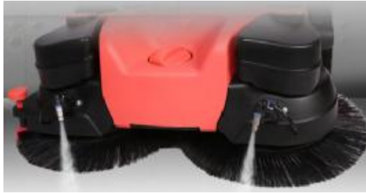
Automatic spray dust suppression Eliminate dust, meet higher cleaning need.

Add: No. 11 Changchun Road, Zhengzhou, China; Tel: +86-371-58651986, 18339818406