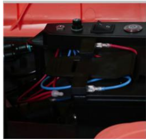
Multiple line protection Ensure safe operation in different environments.