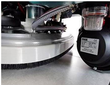
Italy AMER front drive strong and reliable power