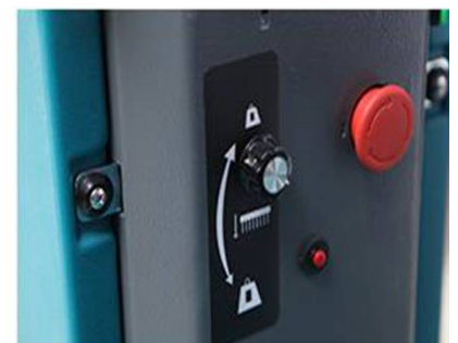
Adjustable ground pressure system Suitable for multiple venues