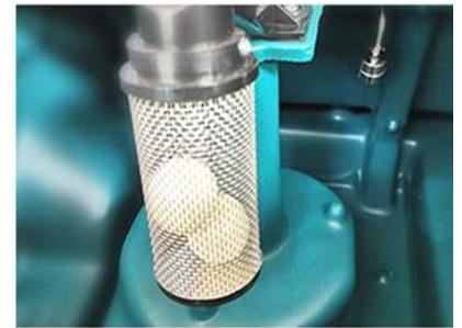
Sewage tank equipped with water level sensor