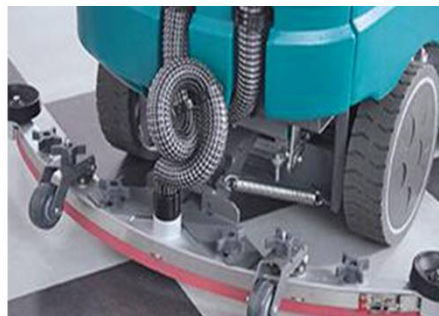
Unique water absorption system Large body small decibel 58db