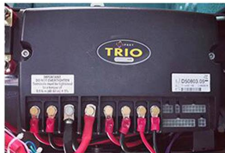
British PG intelligent control system is easy to operate