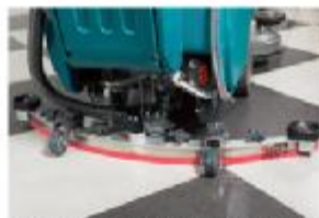
External water level display tube Better grasp of clear water