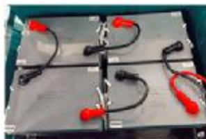
4 maintenance free durable batteries and don't need manual maintenance

With dual brushes PA860 is an easy-handling machine for large and medium area with low operating cost. This machine is self-propelled which can save cleaning workload greatly. The dual brushes enhance the cleaning efficiency and save the cost. Equipped with powerful electronic controlling system, scrubbing and drying functions can be operated easily. Due to the polyester water tank and rear control panel, the machine has lower sound level. Moving forward, backward and the brushes can be controlled by the operating handle.