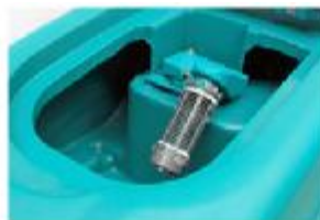
Perfect protection motor