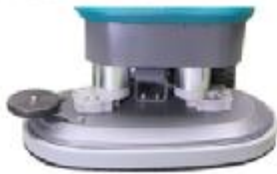
Double brush, more efficient cleaning